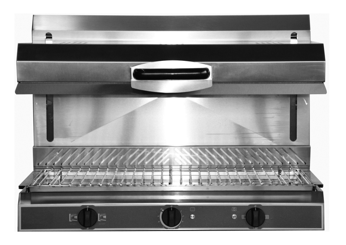
Made in France